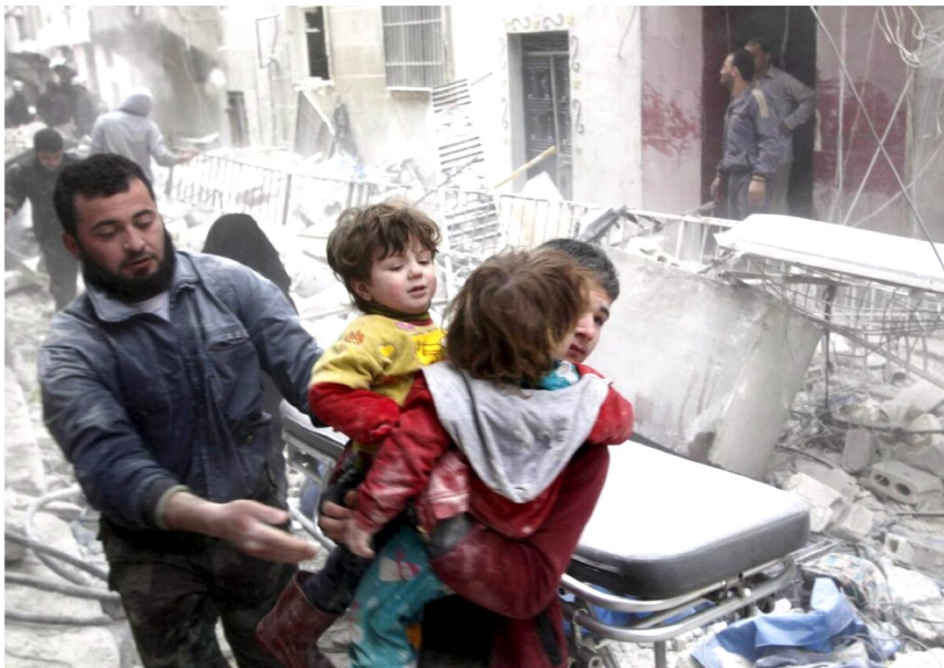
A boy carries two children as he evacuates them from a site hit by what activists said was a barrel bomb dropped by forces loyal to Syria's President Bashar al-Assad in Aleppo's al-Fardous district April 2, 2015.

MOSCOW (Reuters) - The Syrian government and some opposition figures will start a second round of talks in Moscow on Monday focusing on humanitarian issues, although a broader agreement is unlikely as Syria's main opposition group continues to boycott the talks.